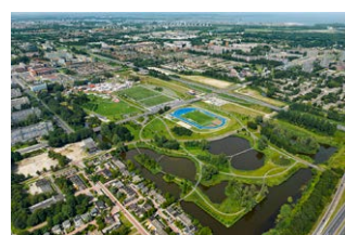
Nelson Mandela Park, Amsterdam, NL Size: 413,000 m 2 Year: 2003-2011