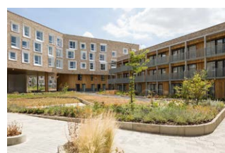
Key Worker Housing, University of Cambridge, UK Size: 27,746 m 2 Year: 2012-2018