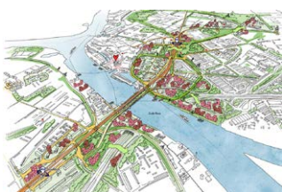
Ontwikkelingsvisie Spoorzone, Dordrecht, NL Year: 2020