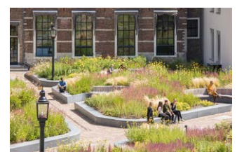
Hoogheemraadschap, Delft, NL Size: 8,800 m 2 Year: 2014-2017