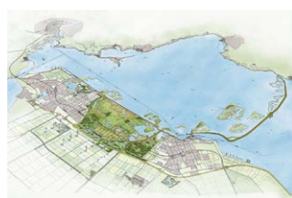
Nationaal Park Nieuw Land, NL Size: 28,900 ha Year: 2018-2019