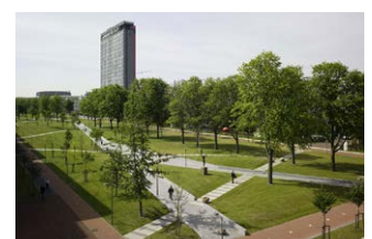
Delft University of Technology campus, Delft, NL Size: 10 ha Year: 2004-2009